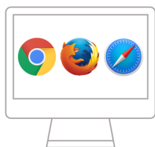
PC and Mac Chrome | Firefox | Safari

1 Use a computer or device with camera/microphone